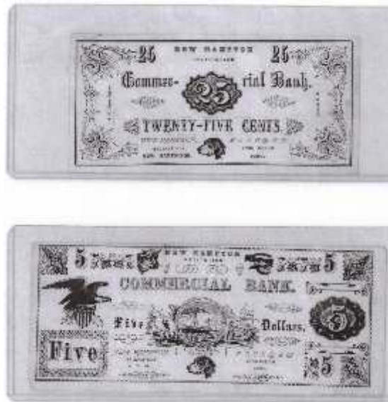
Actual printed bills New Hampton Institution Commercial Bank, NH