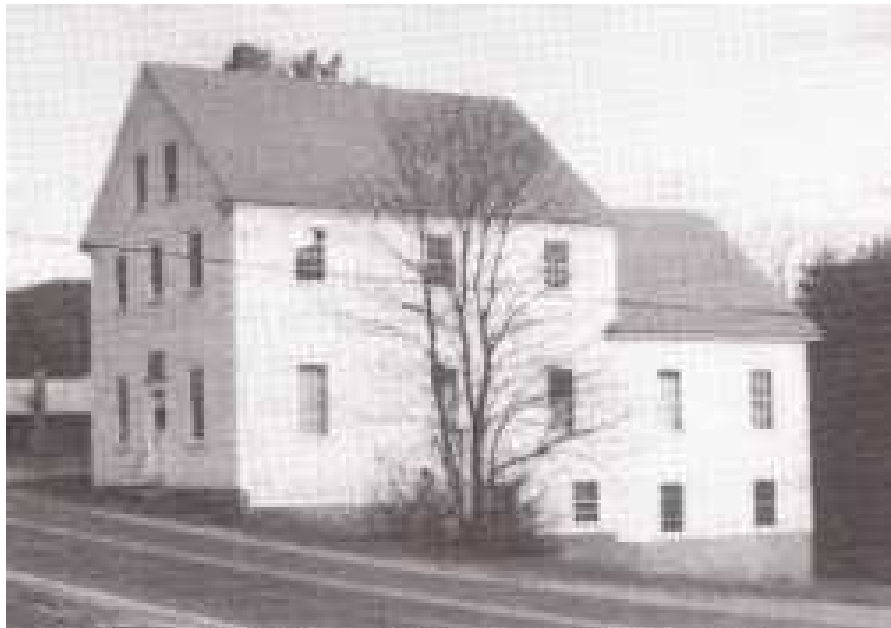
The Grange Hall (currently)

According to Edwin Huckins (our lifelong resident and local historian) "To move New Hampton's Grange they attached beams underneath and put iron boiler wheels on the beams (boiler wheels came from boilers hauled into the woods to process lumber). Oxen were used to run a winch attached to ropes that were affixed to trees or other objects and on the other end the boiler wheel beams and building. The oxen were hooked up to spokes that turned the wheel on the winch, but because the oxen could not jump over the rope they had two sets of oxen and when they reached the rope one pair was detached, the spoke harness brought to the other side of the rope and the next pair attached. They did this over and over for several days until the grange was in the right spot."