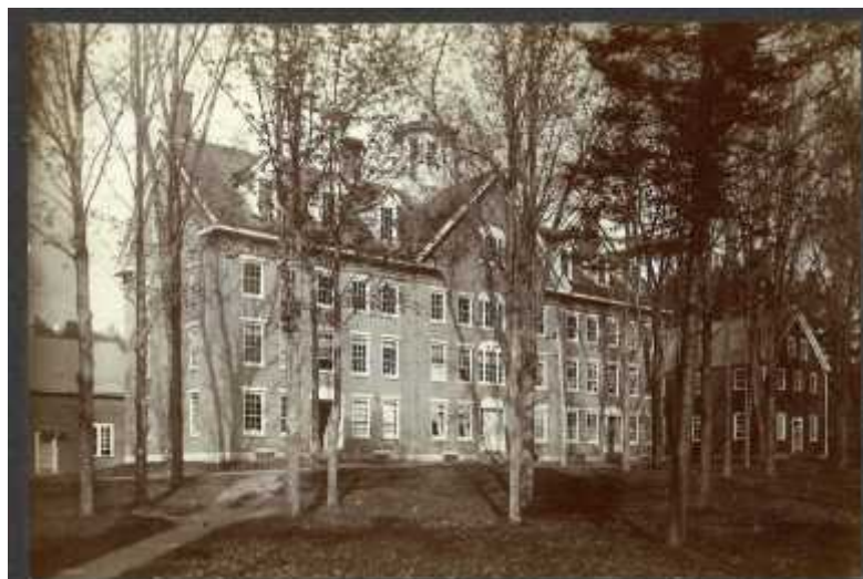
Grange shown to the far right where Lane Hall is now located. (c. early 1900’s)