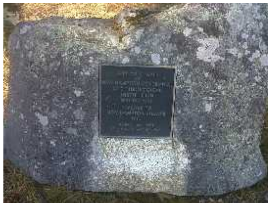
“Site of Chapel Erected 1826” Monument that was placed next to the Town House